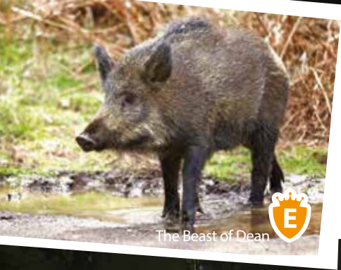
The Beast of Dean